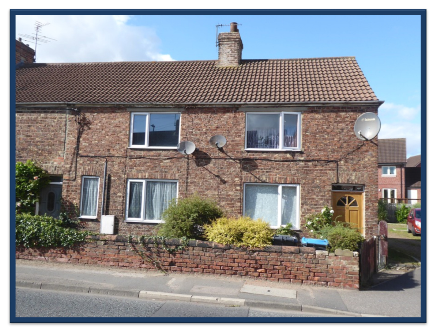
A Conveniently Positioned End Terraced 2-Bedroomed Traditional Cottage Property with Hardstanding to Rear, Currently Tenanted on a Assured Shorthold Tenancy